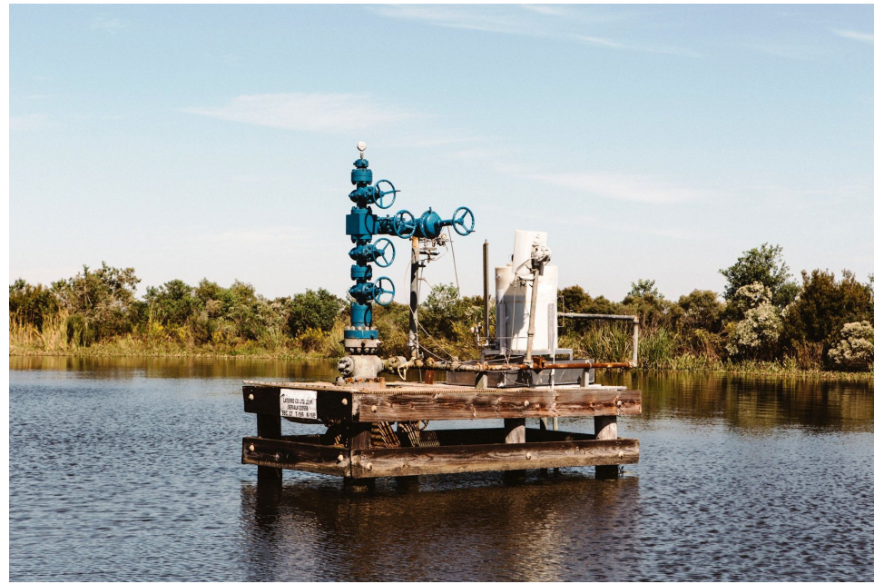
Isle de Jean Charles, 1998. These narrow strips of water are canals that have been cut into the marshland to allow boats to get to oil wells.